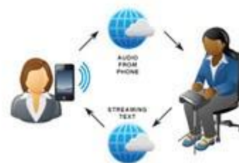
Remote CART to Mobile Device

Great for small group work: Much of today's learning is done in small groups working collaboratively. With remote CART, students can use their smartphone or tablet to view the translated text from multiple participants.