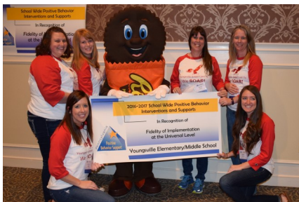
In the photo: The Youngsville Elementary/ Middle School PBIS Team

data as required by the PAPBS Network program evaluators.