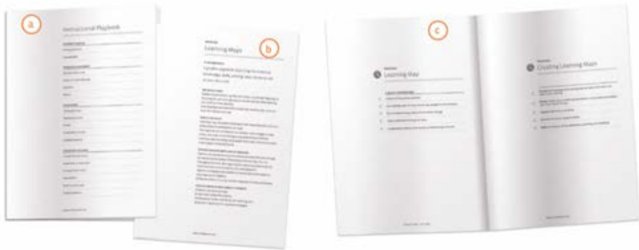
A full Instructional Playbook, including one-page descriptions and checklists for each teaching strategy is included in The Impact Cycle: What Instructional Coaches Should Do to Foster Powerful Improvements in teaching .