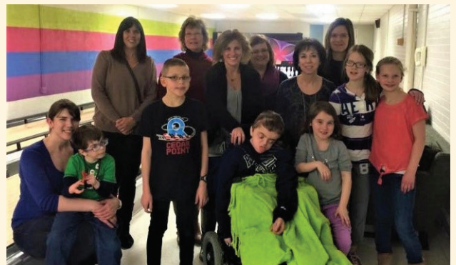
Family members had a great time bowling at Western PA School for Blind Children during a PPDB sponsored social event.

Annual dues are $10 for an individual or $15 for a family. Lifetime memberships are also available for $100 for individuals or families.