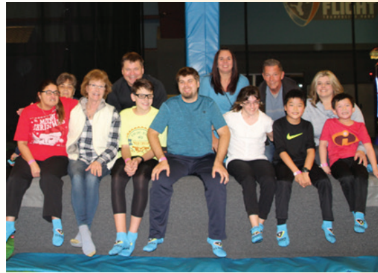
PPDB members having fun times at Flight Trampoline Park in Bridgeville, PA